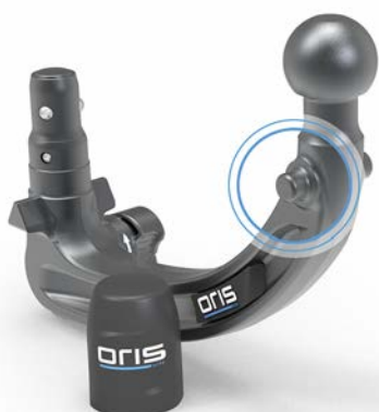
FIX4BIKE®-pins on the side of the towball neck: the unique positioning aid

Like all conventional carrier systems, the ORIS TRACC is mounted in a few simple steps using a standard quick-release fastener. With the patented FIX4BIKE®-version, only one movement is required to mount or dismount the system. The ORIS TRACC FIX4BIKE®-bike carrier, which is suitable for all FIX4BIKE®-towbars, is positioned above the towball and then simply lowered until it audibly clicks into place automatically, securely and safely. This bike carrier benefits from the clever concept of the FIX4BIKE®-towbar. The forces that occur are not only transmitted via the towball, as is the case with conventional clamping systems, but to a large extent via two special pins, called FIX4BIKE®-pins, which are located on the sides of the towball neck. While the ORIS TRACC FIX4BIKE®-bike carrier only fits on a FIX4BIKE®-towbar, the FIX4BIKE®-towbar is compatible with all standard towbar mounted bike carriers.