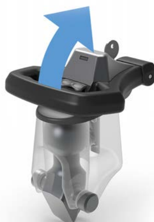
Carrier mounting made easy: easy handling thanks to the integrated FIX4BIKE®-adapter