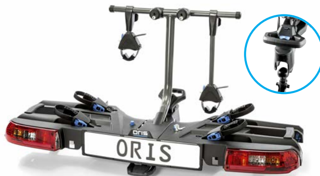
ORIS TRACC FIX4BIKE® Art. no. 710-002