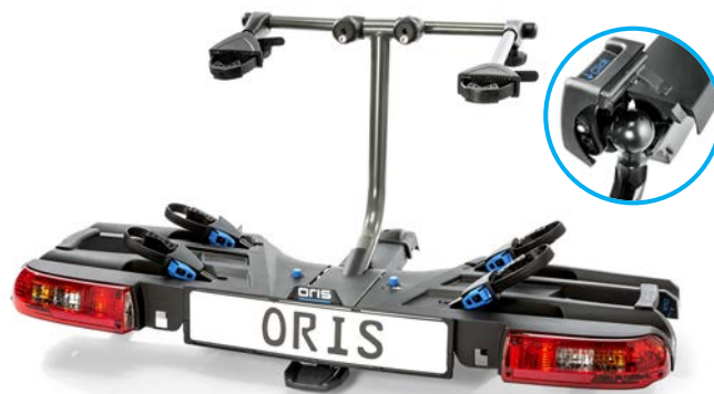
ORIS TRACC Art. no. 700-002

(4) (5) When using the optionally available long ratchet strap (50 cm) and long tyre ratchet strap (50 cm), both optionally available.